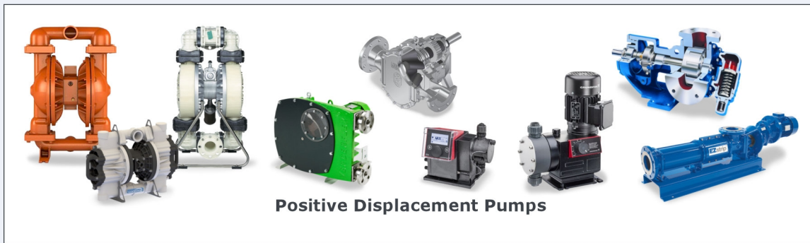
Positive Displacement Pumps