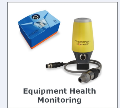
Equipment Health Monitoring