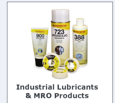
Industrial Lubricants & MRO Products