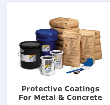
Protective Coatings For Metal & Concrete