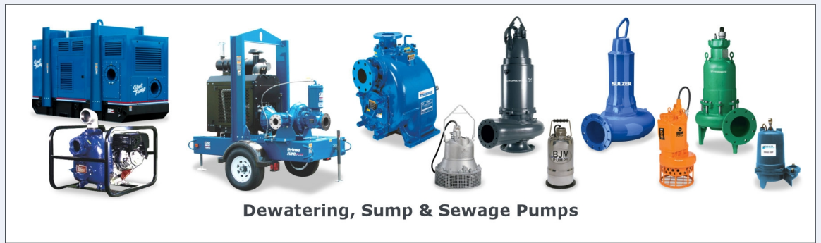
Dewatering, Sump & Sewage Pumps

Having our customers' backs — providing you with fluid handling solutions specifically engineered for efficiency and profitability — has always been our focus . We work with the world's top fluid technology OEM manufacturers so our customers get innovative equipment that makes a real difference in performance and help reduce total cost of ownership.