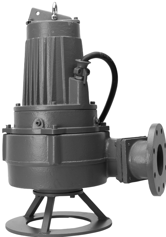
Shown with optional stand