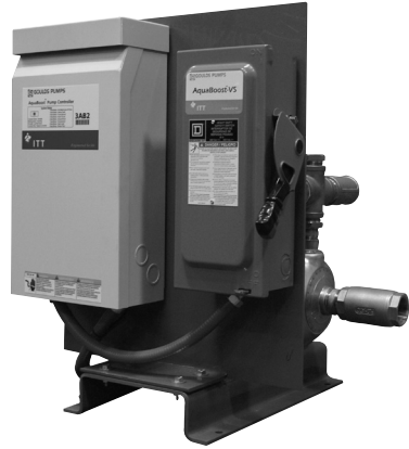
Maximum Weight 206 Lbs.