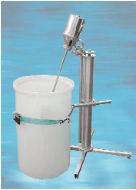
Adjustable Tank Positioning Arm and Ratchet Strap are available for precise and secure positioning of mixing tank. This option is especially useful as a safety measure to prevent the mixer stand from possible movement under vigorous mixing loads.