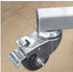
Optional casters include high-quality locking wheels and swivels.

Sharpe Mixers' "ALS-Series" Air-Lift Mixer Stands are a result of uncompromising demands for quality and versatility. When a sturdy, compact, stable and easy-clean stand is required, Sharpe's unique design is clearly the best. The modular construction offers simple and precise adjustment for various applications, and allows for shipment via UPS on most sizes. The air cylinder is enclosed within a sealed column for protection and cleanliness. Long legs bolt onto the flanged column to create a wide and stable base. The ends of the legs are drilled for installation, or can be supplied with leveling glides or locking caster wheels for excellent mobility. The oversized cylinder ram is mated with a stainless torque arm and polyurethane glide bearing for smooth and stable operation. Chrome plated or solid stainless counterweights are available as well to balance the mixer weight.