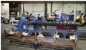
Machining and Pump Repair