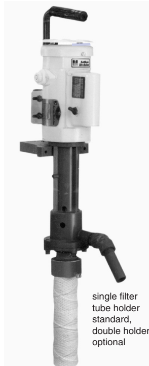
single filter tube holder standard, double holder optional

Models SSF 5 & SSF 10 for filtration to 720 GPH (2,725 LPH)