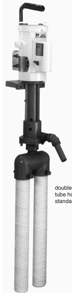
double filter tube holder standard

Models SSF 15 & SSF 20 for filtration to 2,000 GPH (7,590 LPH)