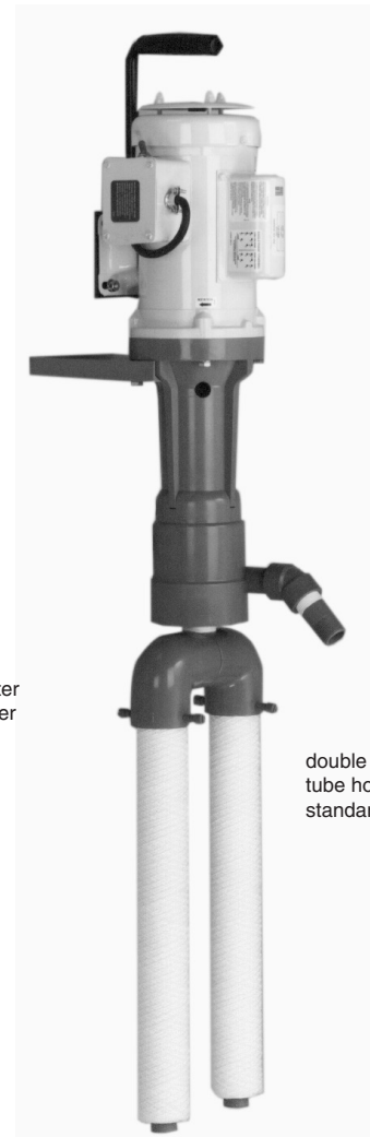
double filter tube holder standard

Model SSF 30 for filtration to 3,000 GPH (11,355 LPH)