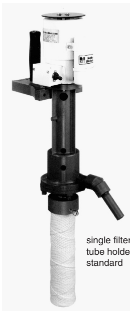
single filter tube holder standard

✓ Only one moving part makes these filter systems virtually maintenance free. In the unlikely event that service is necessary, Sethco Sealless Suction Filters are field repairable and do not have to be returned to the factory for repair.