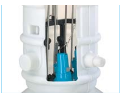
Packaged submersible pump stations with sythetic sump (Type SKB) and GRP pumps