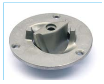
Hardened stainless-steel cutters (HRC 55) in the GRP series