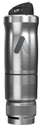
Falcon wireless tri-axial vibration accelerometer sensor