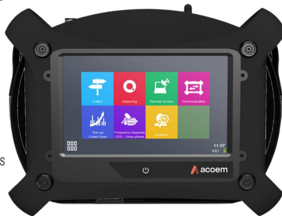
Falcon EX Ultimate intrinsically safe vibration analyzer